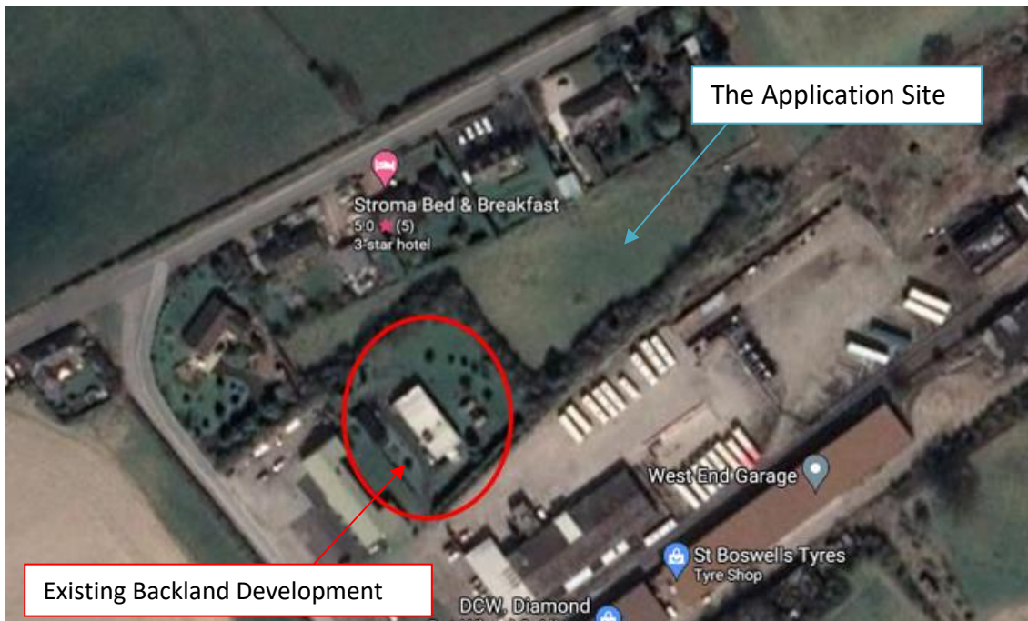
Figure 1: Residential property outlined in Red (Annotated Google Maps)

The neighboring operations have not altered since the submitted Noise Assessment prepared by KSG Acoustics was undertaken and as such we consider it to be up to date for the purpose of this planning application for residential development. The assessment concluded there are no significant noise concerns and as such noise should not be a material reason for refusal.